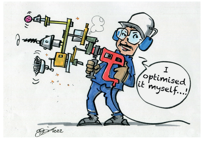
That's not the way to do it! With XERVON Wind you have an experienced, professional partner at your side. We keep your systems in a safe operational condition, so you don't have to worry

Any faults in the functioning of the systems have to be remedied immediately to prevent hazards to employees or other third parties.