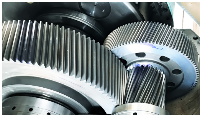
Toothed gearing system spur gear stage

The wind turbine's drivetrain plays a pivotal role in facilitating the efficient conversion of wind kinetic energy into electrical power. Our modular service concepts encompass strategies designed with the overarching goal of consistently ensuring optimal system availability throughout the operational lifetime.